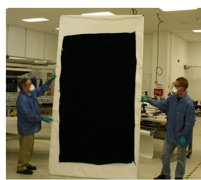
Figure 1. Large 8'x4' CNT Sheet

The Figures below show the state of readiness for use in manufacturing. CNT sheets and seamed rolls run successfully on production prepreg machines and are planned for integration into key aerospace systems. Yarns are now produced at the rate of 1km for an 8-hour shift and applications range from mesh antenna structures, wearable electronics, and conductive wiring. R&D will continue on property tailoring but the key need is production scale-up.