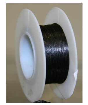
Figure 2. 1km of CNT Yarn